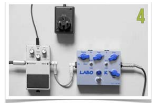
INTERCONNEXION DES DEUX PEDALES