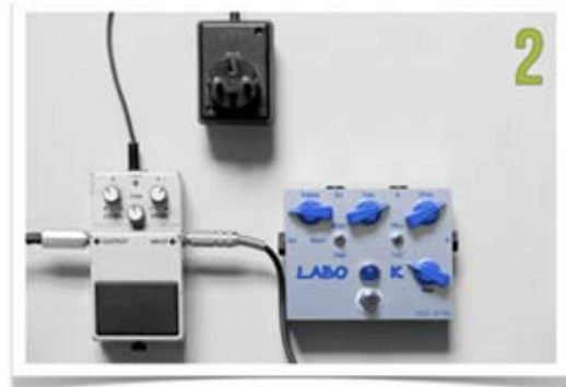
AJOUT D'UNE PEDALE LABO ★ K