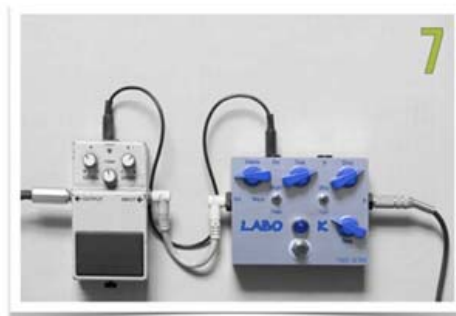
POSSIBILITE D'UTILISER LA PILE INTERNE DE LA LABO ★ K POUR ALIMENTER UNE 2EME PEDALE VIA LE CORDON POWER-LINK