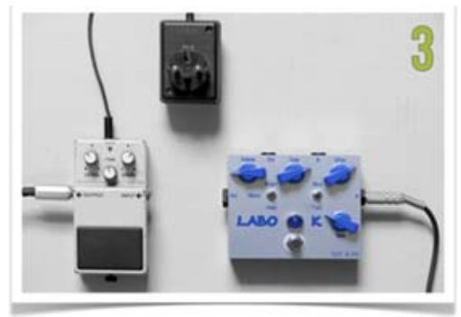
BRANCHEMENT DE LA GUITARE SUR LA LABO ★ K