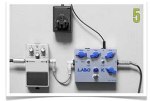
ALIMENTATION EXTERNE DANS LE CONNECTEUR "IN" DE LA LABO ★ K