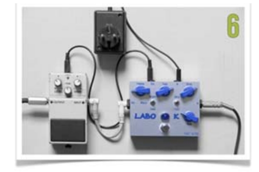
ALIMENTATION DE LA DEUXIEME PEDALE AVEC LE CORDON POWER-LINK