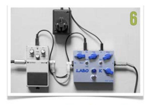
ALIMENTATION DE LA DEUXIEME PEDALE AVEC LE CORDON POWER-LINK