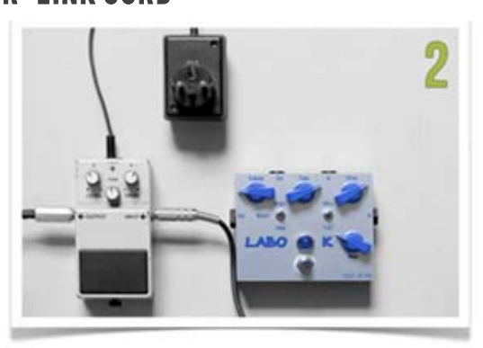
AJOUT D'UNE PEDALE LABO ★ K