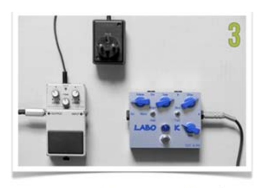
BRANCHEMENT DE LA GUITARE SUR LA LABO 🖈 K