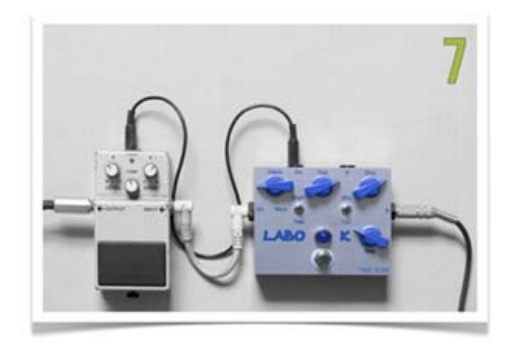
POSSIBILITE D'UTILISER LA PILE INTERNE DE LA LABO ★ K POUR ALIMENTER UNE 2EME PEDALE VIA LE CORDON POWER-LINK