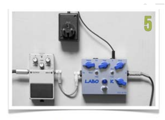
ALIMENTATION EXTERNE DANS LE CONNECTEUR "IN" De la labo ★ K