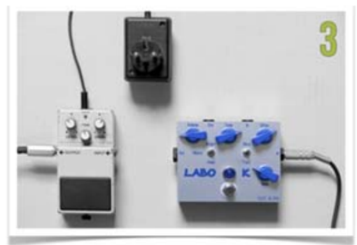
BRANCHEMENT DE LA GUITARE SUR LA LABO ★ K