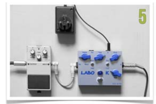
ALIMENTATION EXTERNE DANS LE CONNECTEUR "IN" DE LA LABO ★ K