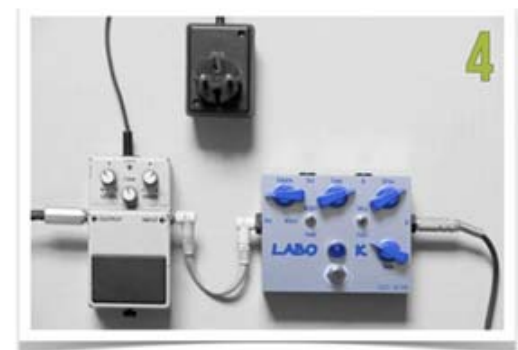
INTERCONNEXION DES DEUX PEDALES